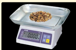
Fish tray ▲