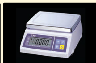
Stainless steel platter ▲