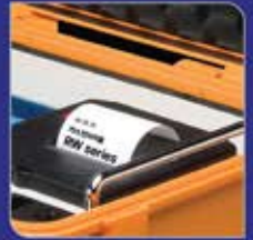
Built in printer